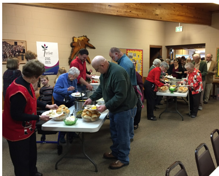
Above left: The Church Choir performs an anthem entitled Some Children See Him during Sunday morning worship on December 13; Above right: Members and guests line up for a meal in the Fellowship Hall; Below right; the Praise Team performs special music during the Christmas Eve service.